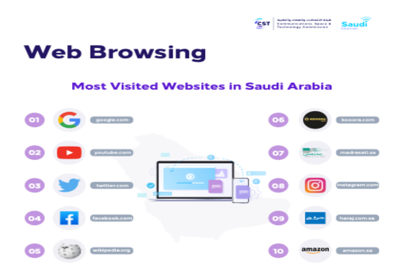
Figure 1. Most visited websites in Saudi Arabia

In the era of technology, students often use social media as an independent and informal language-learning method. Therefore, the primary focus in this study is on the role of social media, specifically, in developing pragmatic skills, rather than other technologies that are usually used in language learning. The choice to focus on social media can be justified by its widespread use in the Saudi context. According to the latest report issued by the Saudi Communications, Space & Technology Commission (2022), approximately 50% of Internet users in Saudi Arabia spend about seven hours or more online every day across four social media platforms (i.e., Facebook, YouTube, Twitter and Instagram; these are among the top 10 ten visited websites in Saudi Arabia [see figure 1]. This widespread use of social media has made it easier for people in Saudi Arabia to communicate with people with different linguistic backgrounds from all over the world using English as a global language of communication, as well as giving them exposure to richer and more authentic content in the English language (Sharma, 2019). Therefore, it is worthwhile to see if this increased social media use among people in Saudi Arabia has any influence on the development of Saudi EFL pragmatic skills.