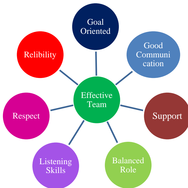
Figure 2. Effective Team Management with the Productive System

All team conversations are kept on file, which comes in useful in the future. A wide range of circumstances Furthermore, a short perusal of the faculty may use messaging recordings. There is team cooperation going on, as well as providing timely information. Figure 2 shows the effective team management roles of the system.