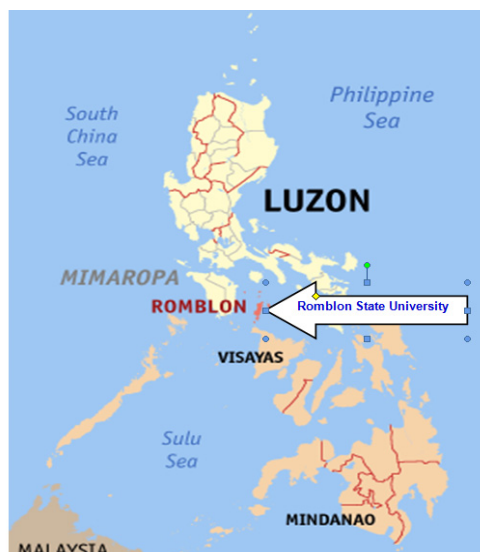
Figure 2. Romblon State University is Located Near the Center of the Philippine Archipelago

The descriptive development research design was used to determine the status of the BSAGEn Program as regards standards of excellence, the application to the job of the graduates’ knowledge and skills, likewise the job satisfaction level to develop a management enhancement program. The study was conducted at Romblon State University (RSU) in Romblon, Philippines. However, other places wherever the graduates are employed were included in the conduct of this research. RSU is geographically located at the central part of Tablas Island. It caters services to the people of Romblon and students of nearby places like Mindoro, Batangas, Aklan, and Antique. The university has been the venue of several class reunions when the graduates share experiences especially about their present employment. The government and non-government establishments scattered over the seven islands serve as the workplaces of most RSU graduates – thus the setting of the study.