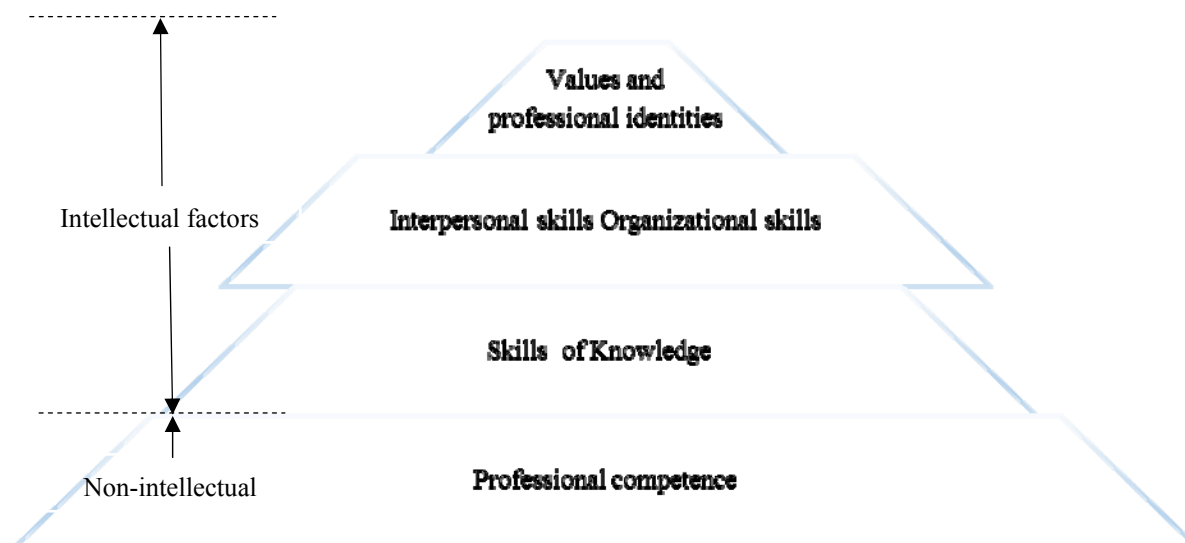
Figure 1. Basic framework for the financial professional competence

At the top of the framework, values of professional identity belong to the ideological category. Financial education should cultivate students' moral concept and strengthen the social responsibilities. At the same time, we should pay great attention to cultivate the students' financial emotion and the professional identity. Only devote themselves from heart to a financial professional, can they continue to learn, research and innovate to promote their financial theory and practice.