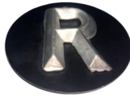
Figure 1. Iron and Tin bonded together

In first attempt, the development of PRESS was using iron and tin (Figure 1). Tin was attached to the iron using soldering method. The tin already has patterns with certain coding (number and letter). The combination of iron and tin were placed in a rubber container using rivets (Figure 2).