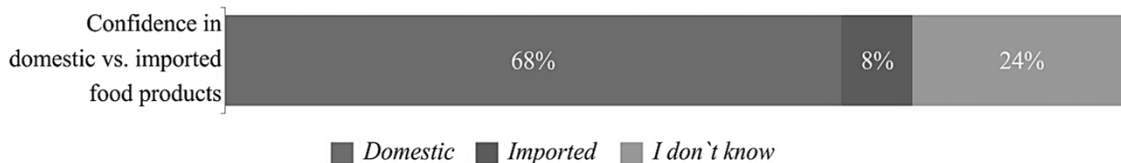
Figure 2. Confidence in domestic vs. imported food products in BiH (Author's research)

For the large number of consumers, the country of origin is the third criterion to guide the decision-making about purchasing food products. This is why the study sought to explain in more detail the perception of consumers about domestic food products. Generally, BiH consumers have a very positive attitude towards domestic food products. More than 2/3 of respondents have more confidence in domestic food brands compared to imported ones (Figure 2).