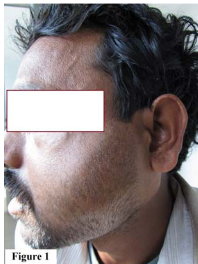
Figure 1 Photograph (lateral view) depicting the swelling in the left parotid region.

He noticed an ulcerative growth in the left gingivo-buccal sulcus 1 month back. Biopsy of the ulcer margin revealed it as mucocoele. He also developed a swelling in the left parotid region around the same time which started increasing in size at an alarming rate (Figure 1). Ultrasonography with color Doppler of the abdomen showed a large well defined heterogeneous space occupying lesion (SOL) in the right renal fossa, suggestive of RCC; inferior vena cava thrombus was not detected. Contrast enhanced computerized tomography (CECT) scan of the abdomen revealed a large well defined heterogeneously enhancing right renal mass (16 cm x 12 cm) with internal necrosis. This mass was involving the vascular pedicle; perinephric fat stranding and adjacent mass effect was also noticed (Figure 2A). Magnetic Resonance Imaging (MRI) of the abdomen also depicted a well defined heterogeneously enhancing SOL in the right kidney with no tumor thrombus (Figure 2B). CT scan of the head and neck showed a bulky and heterogeneous left parotid gland extending into the nasopharynx and displacing its lateral wall medially, suggesting neoplastic involvement (Figure 3). Fine needle aspiration cytology of the parotid swelling revealed it as metastatic clear cell adenocarcinoma with renal tubule formation.