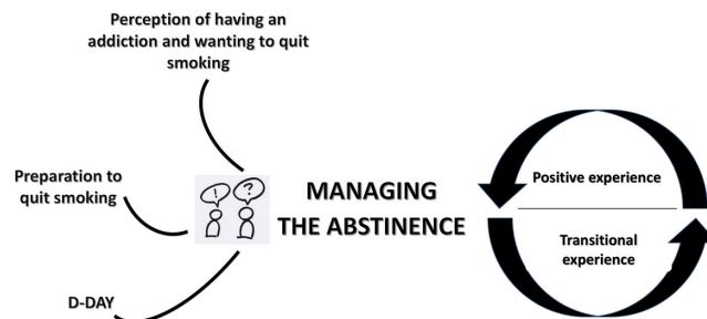
Figure 2. Controlling the urge to smoke as a central process in smoking cessation

a sense that abstinence "can be maintained" in everyday life. Finally, the process of smoking cessation advances when the individual feels that he or she is in control of the urge to smoke and expects to continue to be in control.