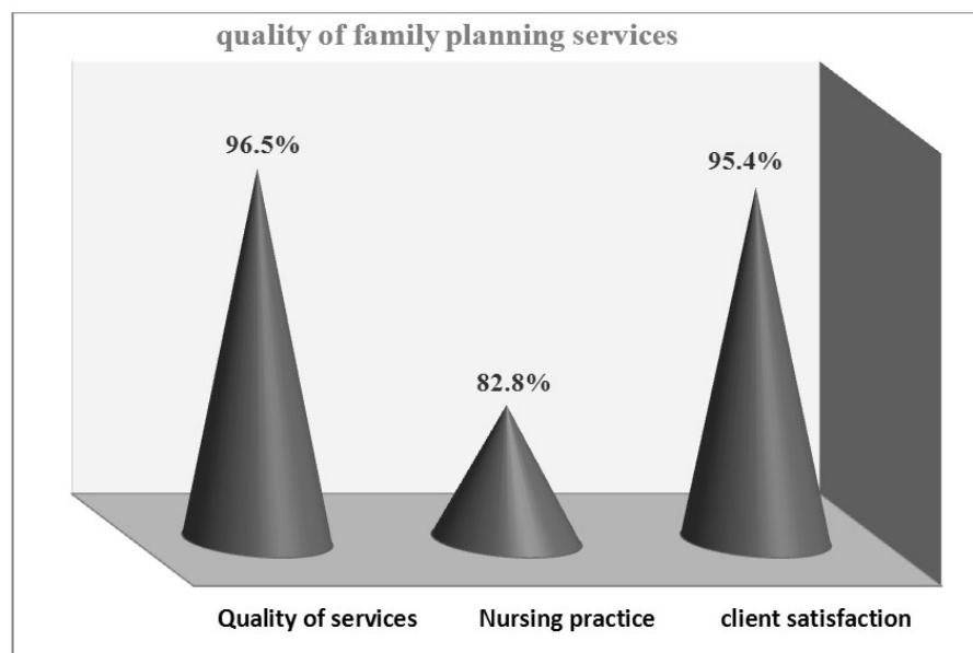
Figure 3. Association between the quality of family planning services, nurses practice and client satisfaction

(*) Statistically significant at P < .05