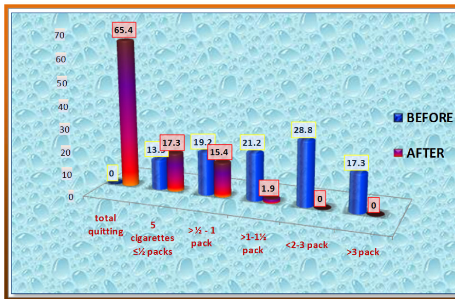
Figure 2: Distribution of studied students in relation to smoked packs before and after intervention

program while the percentage of smoking >1-1.5 packs/day was 21.2% before compared to 1.9% after implementing the program, and smoking 5- ≤ 1/2 packs/day decreased from 17.3% to 13.5% after practicing hypnosis for nine weeks (see Figure 2).