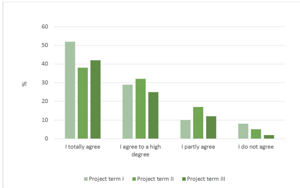
Figure 2. The students’ views on the value, for their future studies, to receive skills in academic writing

need teachers to explain and give much more examples than those we got. Do not forget that students feel bad and will lose their self-confidence when having to work on an assignment repeatedly. It was soooooo difficult! [student, project term I]