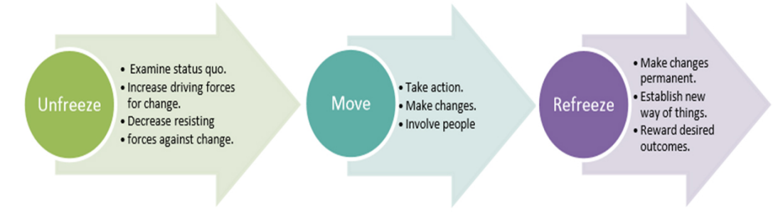
Figure 1. Kurt Lewin's 3 step model

The most common models of change are the change model of Lewin<sup>[13]</sup> who reported that organizational change includes a move from one standing state by means of a progression shift, to another standing state. The model consists of a three-stage namely: unfreezing, moving, and re-freezing stage (see Figure 1).