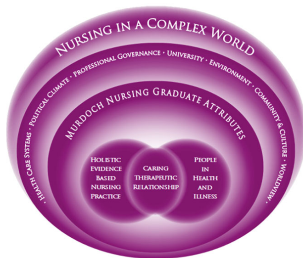
Figure 2. Program conceptual model: Nursing in a Complex World

Central to our model is that specific characteristic that embodies the goal that as nurses we strive to attain, and that is the Caring, Therapeutic Relationship. As a faculty we believed it was essential to write a curriculum that has the capacity to support nursing students to prepare for the many complex contextual components they will encounter and the varied outcomes that can result when trying to build that relationship. Following discussion within working groups the Nursing faculty felt these components were best represented by the program content domains of: People in Health and Illness and Holistic Evidence Based Nursing Care. The intersect created by the learning that occurs in these specific domains facilitates the building of the central element or goal, which is the Caring Therapeutic Relationship (see Figure 2).