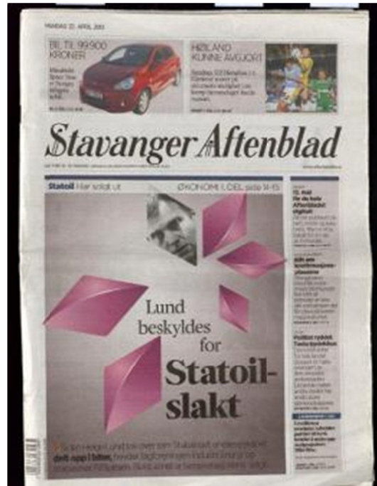
Figure 2. An alternative interpretation of the narrative represented by Statoil's logo. (Illustration made by Olav B. Svalland for Stavanger Aftenblad 22 April 2013.)

It is also of interest to note how Statoil use multimodal texts when presenting their values on the website, cfr. Figure 3.