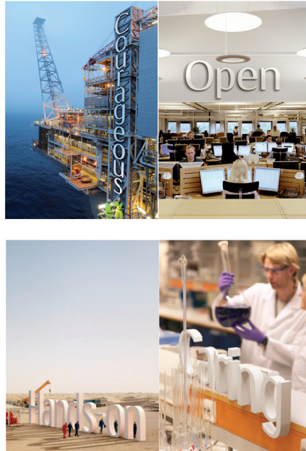
Figure 3. Core values of Statoil presented as multimodal texts

It is also of interest to note how Statoil use multimodal texts when presenting their values on the website, cfr. Figure 3.