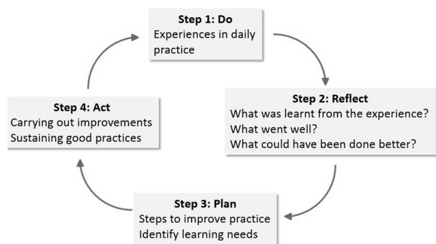
Figure 2. “Do, Reflect, Plan, Act” cycle adapted and simplified from the Clinical Audit Cycle, used in reflective learning and continuous process of self-development and improvement. [28]

Benjamin et al. [28] described the clinical audit cycle as “cyclical or spiral systematic process, with the ultimate aim of improving care”, which shares similar processes and goals as the reflective learning log. A simplified version of “Do, Reflect, Plan Act” can be used to describe reflective learning as a cyclical and continuous process, similar to a clinical audit (see Figure 2).