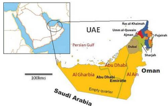
Figure 1. Al-Gharbia region, Abu Dhabi, UAE

included 585 budgeted nursing positions; 435 positions were filled, with the remainder in the process of being filled. Only one of these positions was filled by an Emirati nursing graduate. [4] The AGHS provides primary, secondary, and selective tertiary care to patients in the region. People requiring interventions for high-risk conditions are usually transferred to other hospitals in the city of Abu Dhabi.