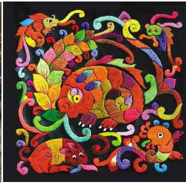
Figure 1-2 Miao dress pattern