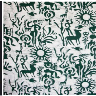
Figure 1-3 Miao batik process