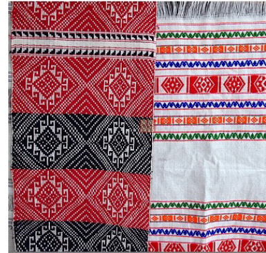
Figure 1-9 Dai brocade