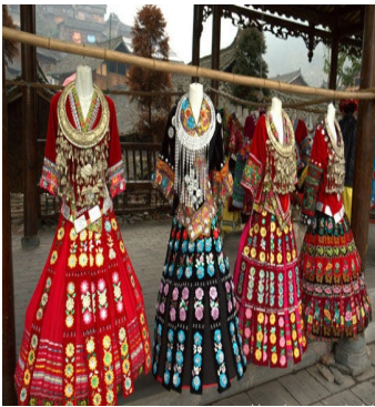
Figure 1-1 Miao clothing model and color

Dress of the Miao people kept the traditional weaving techniques, embroidery and batik, embroidery, when used in one process, other techniques such as cross stitch them interspersed with embroidery, batik embroidery embroidery use, woven together, the colorfulflowers, dress patterns, highlighting the national art features (Fig 1-3).