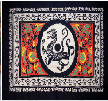
Figure 1-5 Yi dress pattern