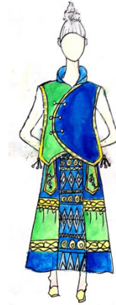
Fig 2-3 the second impression drawing