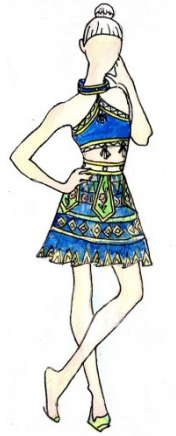
Figure 2-1 the first impression drawing