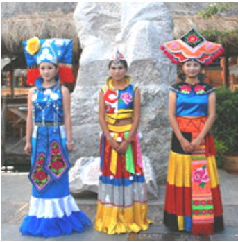
Figure 1-4 Yi clothing model and color

Yi embroidery is not affected by latitude and longitude limitations, combined with the pick, pressure, embedded technology, three-dimensional sense of strong, suitable for embroidered flower patterns. so Yi, embroidery is one of the most representative process, is often used to coat, skirt, trousers, wallet etc. (Fig 1-6)