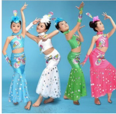
Figure 1-7 Dai clothing model and color