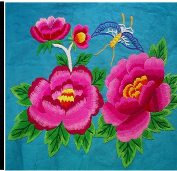
Figure 1-6 Yi embroidery