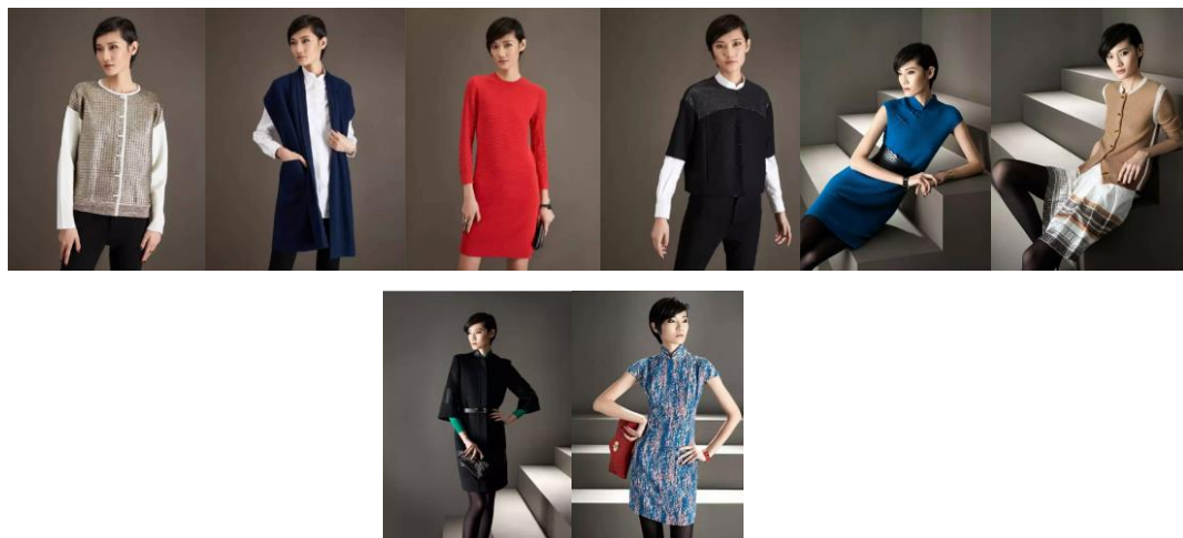
Figure 2. Shanghai Tang 2015 A/W