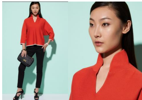
Figure 6. Shanghai Tang's Design of V-shaped Small Stand-up Collar

As basic elements of Chinese traditional clothing, cross collar and slant opening are intrinsically linked. With respect to pattern of Chinese traditional cross collar, under the influence of Confucian traditional clothing etiquette, "the five principles of compass, square, rope, scale and balance should be complied with: the cuff is as round as a compass; the collar is as orthogonal as a square; the back is as vertical as a rope; and the lower hem is as balanced as a scale". Therefore, the shape of traditional cross collar is almost the same with that of Western V-shaped collar. "The shape is like the letter Y". Shanghai Tang's design of deep V-shaped small stand-up collar not only retains the charm of traditional stand-up collar, but also to some extent breaks the shackles of tradition, freeing stand-up collar from the traditional image and creating a compact, stylish, and cool V-shaped small stand-up collar. When the small stand-up collar is designed and combined, the shape immediately changes its traditional charm and becomes more fashionable (Figure 6).