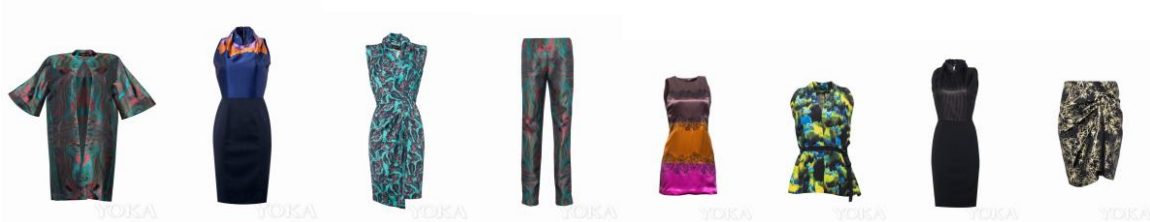
Figure 4. Shanghai Tang 2014 S/S

Shanghai Tang has relatively high color brightness but low purity. The overall effect seems soft and comfortable, which is relating to its high-end but low-key style design. With sapphire blue, scarlet, bright red, cherry red, wheat red, white, khaki, purple, apple green, light blue, brilliant yellow and other bright colors as the color matching series, Shanghai Tang clothing uses black, dark gray, dark blue, coffee, wine red, jeans blue and other major color tones. The colors with high color brightness and relatively low saturation achieve the overall effect of mildness, low-key but luxurious. With respect to seasonality, highly bright colors are added into light colors to create contrasting but not intense briskness, increasing the overall results of vivacity, fashion and recreation of the clothing. (David aaker, 2005)