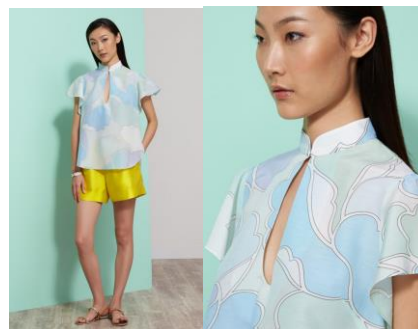
Figure 7. Shanghai Tang's Design of Chinese Deep V-shaped Collar

On the basis of the simple and refreshing deep V-shaped collar, there is a kind of cheongsam collar opened below, a unique collar in new Chinese women's clothing, which displays the subtle beauty of Chinese cheongsam and has the beauty of sensuality and nakedness that modern clothing and Western aesthetics advocate. It can be said that it is a combination integrating practicality, aesthetics and tradition (Figure 7).