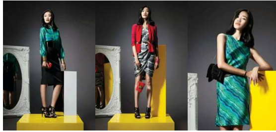
Figure 3. Shanghai Tang 2015 S/S