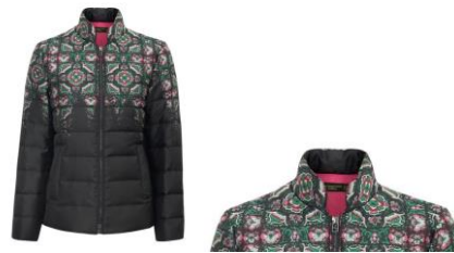
Figure 5. Design of Shanghai Tang's Stand-up Collared Casual Clothing

As basic elements of Chinese traditional clothing, cross collar and slant opening are intrinsically linked. With respect to pattern of Chinese traditional cross collar, under the influence of Confucian traditional clothing etiquette, "the five principles of compass, square, rope, scale and balance should be complied with: the cuff is as round as a compass; the collar is as orthogonal as a square; the back is as vertical as a rope; and the lower hem is as balanced as a scale". Therefore, the shape of traditional cross collar is almost the same with that of Western V-shaped collar. "The shape is like the letter Y". Shanghai Tang's design of deep V-shaped small stand-up collar not only retains the charm of traditional stand-up collar, but also to some extent breaks the shackles of tradition, freeing stand-up collar from the traditional image and creating a compact, stylish, and cool V-shaped small stand-up collar. When the small stand-up collar is designed and combined, the shape immediately changes its traditional charm and becomes more fashionable (Figure 6).