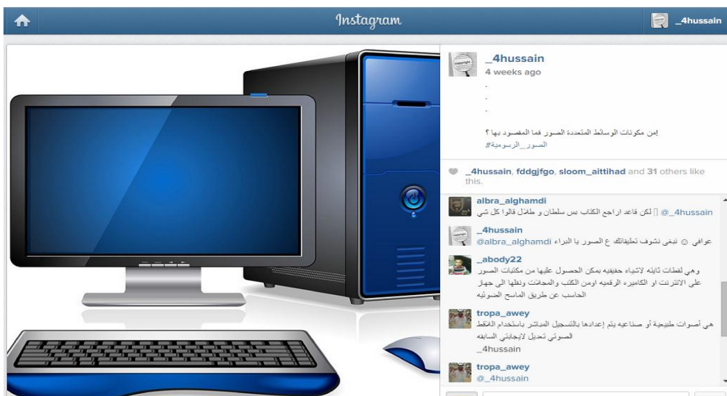
Figure 2. Graphical stimuli form