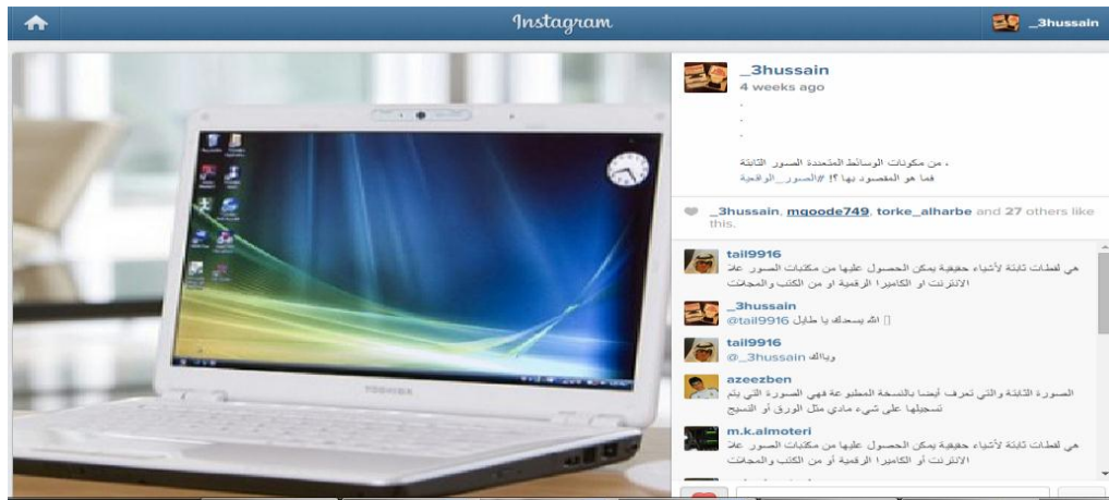
Figure 1. Real stimuli form