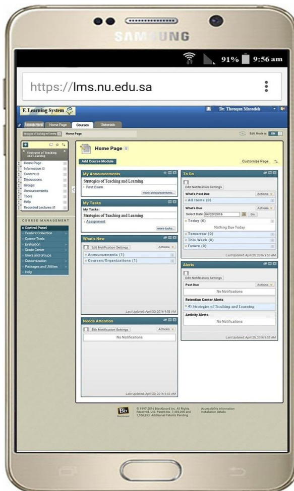
Figure 2. Mobile phone-based website main screen

virtual relations with peers; in addition to the blogs as open communication tools for students to share their ideas were provided by the proposed website delivered via blackboard-based Mobile Learning. Figure (1) also shows that there are three intersections among the three circles, namely DL, DS, and LS. The first intersection "Device Usability (DL)" cares about the common characteristics of aspects related to devices, on one hand, and aspects related to the learner, on the other hand, i.e. tasks dealing with knowledge and its storage. Thus, researchers' reliance on this point was based on the participants' background knowledge in the use of smart mobile phones encouraged by their high economic level and continual carefulness to follow up and keep the most recent devices. Furthermore, they all seemed to be highly capable of accessing, downloading, and saving information via their mobile sets. The second intersection "Social Technology (DS)" represents the social aspect of Mobile Learning, which is fulfilled through forums, groups, and available blogs for students to interact via their mobile phones. The last intersection "Interactive Learning (LS)" accounts for theories of learning and teaching. Figure (2) illustrates mobile phone-based website main screen, which was mainly developed for teaching students.