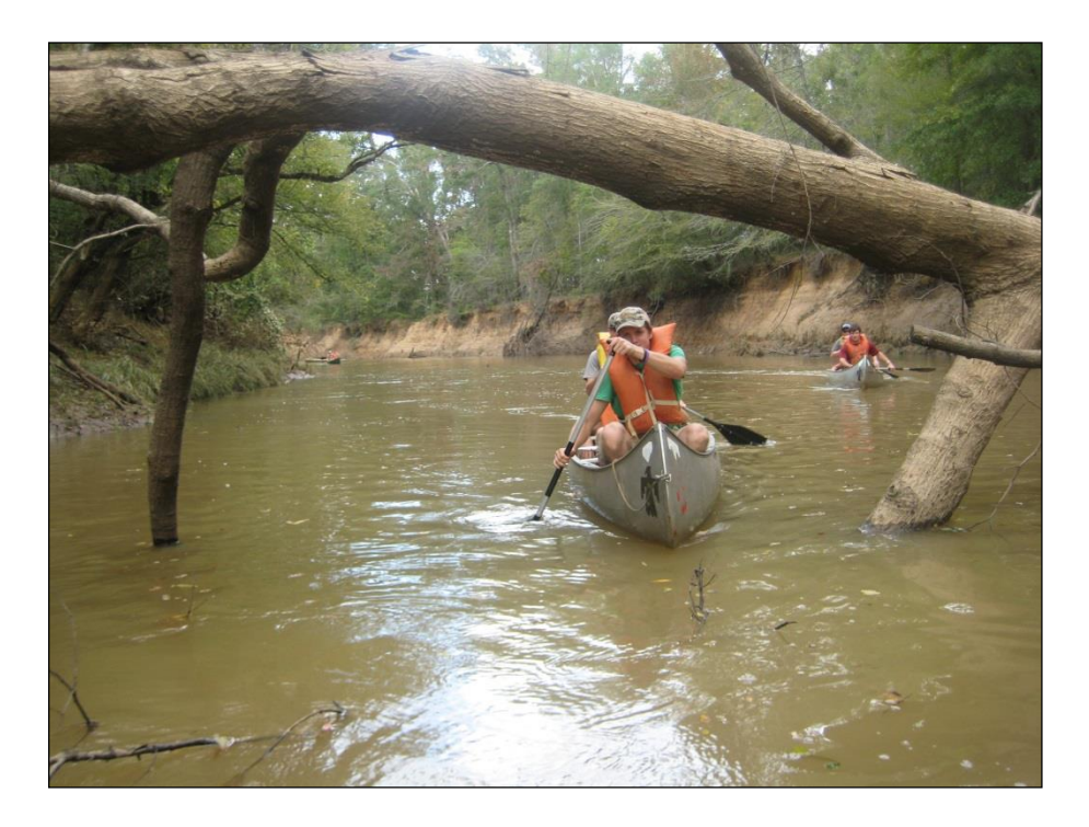
Figure 3. Collaborative teamwork is required for students to complete the Neches River exercise. By the end of the three-hour trip, students develop comradery, a sense of accomplishing an important task, and a connection to the natural resource and profession.