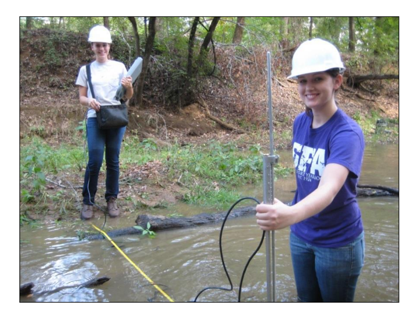
Figure 2. Students at Stephen F. Austin State University using water measuring equipment during field-based collaborative learning exercises.

Students were required to analyze and present their results at a college-level poster symposium and engage in active discussions of their results with other undergraduate and graduate students. Faculty in the college also discussed results with the students. The poster symposium was designed to engage students by combining three broad areas of competency needed by natural resources professions as mentioned above. Student attitudes were assessed with an end of course evaluation that included a qualitative section dealing with what the students found valuable about the course.