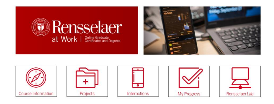
Figure 6a. A snapshot of the custom home page in Canvas used throughout all courses. Five consistent navigation "buttons" are used

Multiple software solutions were explored, but the customizable nature of Canvas (an Instructure product) led to its selection. One valuable feature of this product is that it is HTML based and enables customization of UX and UI. Courses are templatized prior to insertion of project scripting, learning resources, rubrics, or any other content in a course.