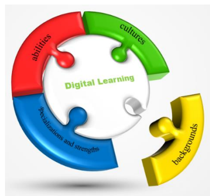
Figure 1. Digital Learning - New possibilities

Educational teams must rethink the appropriate pedagogical approach and the use of innovative technologies in ways for teaching and skills development. Developing meaningful learning environments requires team effort based on collaborations between academia and the community of teachers and curriculum developers (Mayo, 2020). The combination of digital learning diversity opens every educational institution to different worlds and cultures. Diversity of opportunities have been created for students with a wide range of different abilities, different cultures, different backgrounds, specializations and strengths. The post-pandemic world will need new ways of learning and communication (Passantino, 2021).