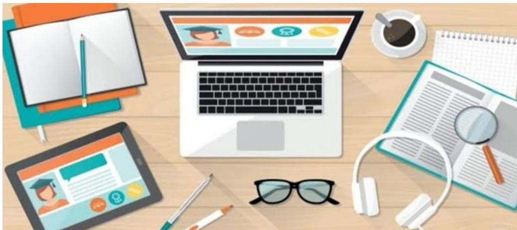
Photograph 2. Sample factor 2 that facilitates distance/online education according to participant P25

Themes: “Technology, internet, communication, a peaceful environment, producing solutions.”