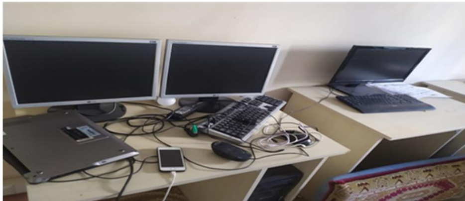
Photograph 4. Sample factor 1 that complicates distance/online education according to participant P26

Three examples of photographs and related stories on the obstacles to distance education during the COVID-19 pandemic are presented below: