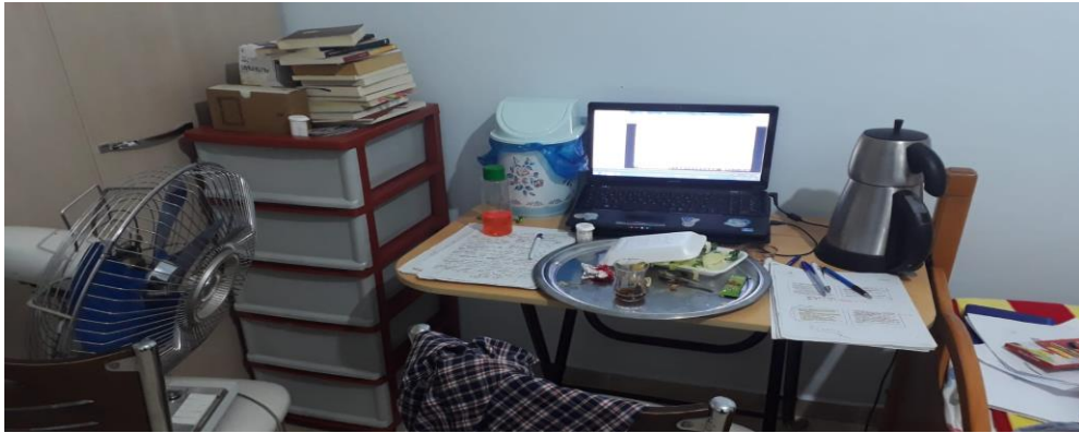
Photograph 1. Sample factor 1 that facilitates distance/online education according to participant P10

Three examples of photographs and related stories on the facilitators of online or distance education during the COVID-19 pandemic are presented below: