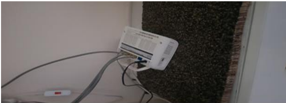
Photograph 5. Sample factor 2 that complicates distance/online education according to participant P36

Themes: “The lack of technological tools and limited internet access”