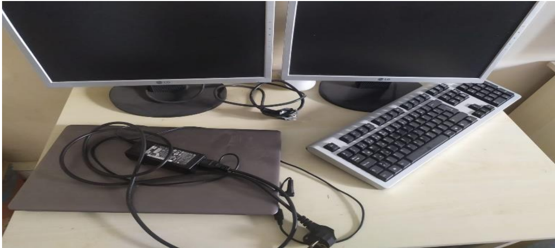
Photograph 3. Sample factor 3 that facilitates distance/online education according to participant P23

Themes: “Internet access, technological devices, individual and distance education.”