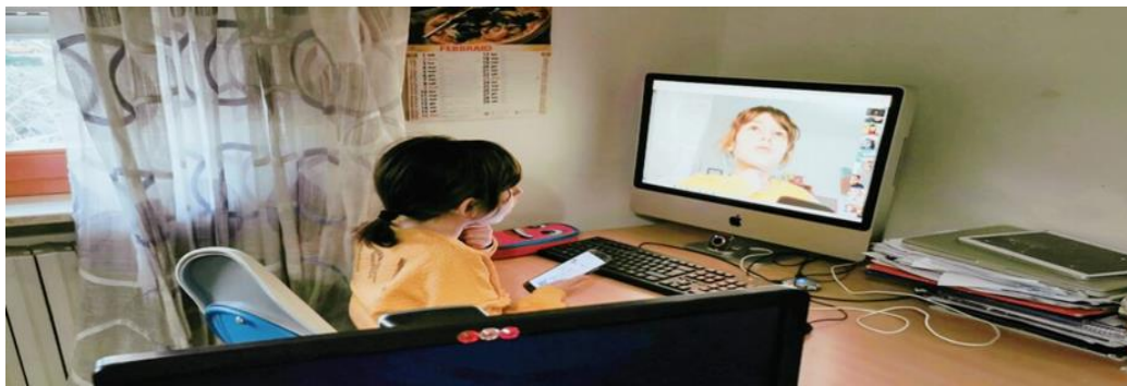
Photograph 6. Sample factor 3 that complicates distance/online education according to participant P12

“The challenging factor in distance education was the internet problems. There was no internet network in our house. And my own internet package was limited, I did not have the opportunity to watch the videos sent by my colleagues. I tried to download the submitted documents and work with these. Of course, reading was not sufficient, it would be much better to hear the views of our esteemed professors in the videos as much as in in the classroom. In the photo, you can see technological devices such as a phone, a computer and a Wi-Fi symbol. Everyone in our house has a phone, and there is a computer (not mine). There are several tools, but when there is no internet, sometimes even these do not make a difference. Frankly, when I looked at the photo, I felt awkward. Even before distance education, I was constantly thinking about how to study without internet. And my brain was overworked already. But luckily, we somehow got through this process. In such a process, education was necessary, but the internet, the point of access to knowledge, was not considered. I am sure there were also those who were worse off than me. For example, students living in the villages. Assistance should have been provided for many students” (P12).