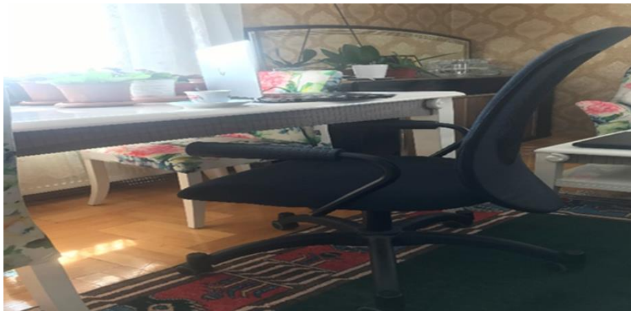
Photograph 7. A visual on the main themes that facilitated distance/online education according to participant P9

"In a big city like Istanbul, it is necessary to leave home a few hours before the class to arrive at the physical classroom. Before, there was a preparation process that involved ironing, dressing, etc. In online education, it is often enough to be next to your computer in a comfortable corner of your home 5-10 minutes before the class. [...]. It is more comfortable, more laid-back, it reduces worries such as 'Could I be at the classroom on time? Is there traffic?' and contributes to focus on the course. Initially, online education could be available at least in courses or departments that do not require physical attendance even at a certain rate, provided that far-away students also have internet access; more accessible and less expensive education may be possible for those who cannot attend a good university in a big city due to financial difficulties. Travel, accommodation and food expenses could be saved and spent on a quality computer that could be used in education" (P9).