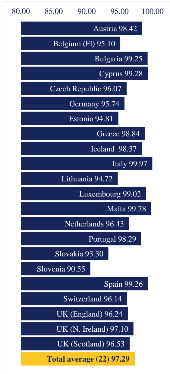
Figure 3. Age sample enrolment rate in inclusive education for 15-year-olds, based on the enrolled school population of 15-year-olds (%)