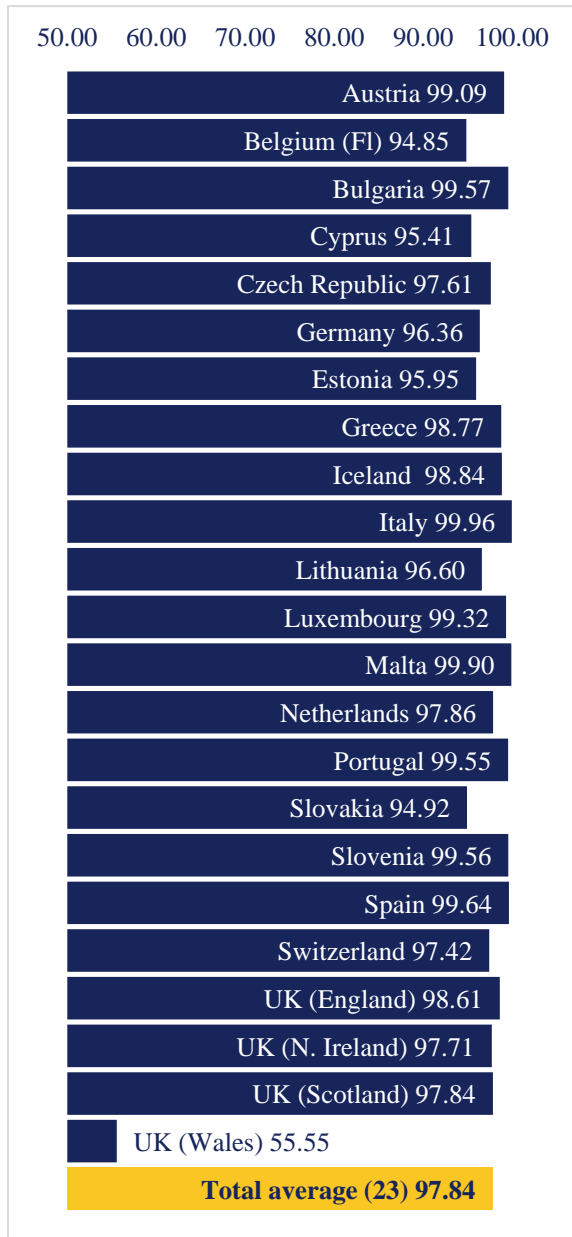
Figure 2. Age sample enrolment rate in inclusive education for 9-year-olds, based on the enrolled school population of 9-year-olds (%)