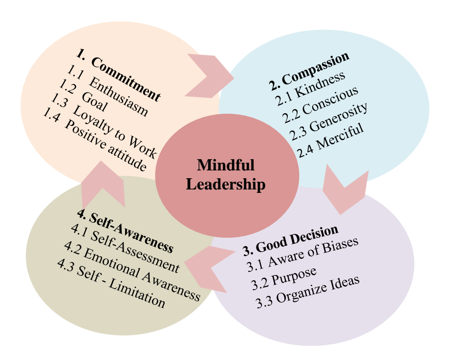
Figure 2. Administration Conceptual Framework for Mindful Leadership Development for Primary School Principals under the Office of the Basic Education Commission in Thailand (The figure was developed by the researchers)

However, the use of this research's results for further research or for the staff development should take into account that the key elements of this study were the result of 17 references; there are 34 theoretical key elements, but four were selected for this study due to their higher frequency. Even though some of the other 30 left elements were lower in frequency, they are worthy of researching. Examples include: continuing consciousness, positive force, staying present, emotional intelligence, lifebuoy, love mercy, modesty, staying focused, listening, paying attention to yourself, being careful, understanding the situation, having responsibility, good adaptability, creativity, holistic process, the need to reduce, agreeing with the participation, distance between thinking and doing, , having a good time, cultivating, uncleanliness one's influence on society, having courage, having patience, accepting failure, developing, innovating, preventing boredom, new generation leader, responding more than silence, having an open mind and not vulgar. Therefore, we suggest the researchers who are interested in the development of the mindful leadership indicators including the organisations that want to develop mindful leadership for their staff consider selecting those elements to use in the research or staff development as well.