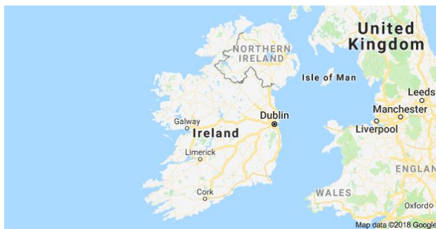
Figure 1. Map of Ireland

The purpose of this study was to determine the extent to which PAs are accepted by citizens in Ireland (see Figure 1). Asking this highly relevant question is at the heart of policy initiatives to deploy PAs across health systems and demographics. To date, PAs have been introduced into various countries without asking for patient input. What is missing in those cases is an understanding of whether these providers are in society's best interest and how patients view them. Understanding patient preferences and willingness to be seen by a clinician who is trained in medical care management, but is not a doctor, is important to guide workforce planning and justify the introduction of new models of healthcare. Studies on patient willingness to be seen by a PA reveals that Americans, Australians, Canadians and Dutch citizens are willing to access new models of care over traditional options, as long as their care needs are met. [2-5] An opportunity to explore the question of the societal benefits of PAs is important prior to people having the experience of being cared for by a PA. This work takes advantage of other exploratory studies which have examined the concept of "willingness to be seen" and with which these findings concur. [2-5]