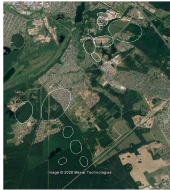
Figure 1. Ring structures of positive and negative type with watering and swamping in the Mirny-Boriskovo are and ZhKSolovininayaRoscha and Fairy Forest

The most visual comparison of the city territory with active ring structures is reflected through the superposition of the data of the selected objects on the scheme of the existing functional zoning of the city. In the context of this article, the distribution of functional zones in areas with a large number of active hydrogen degassing structures was analyzed - in the Volga and Soviet districts of the city.