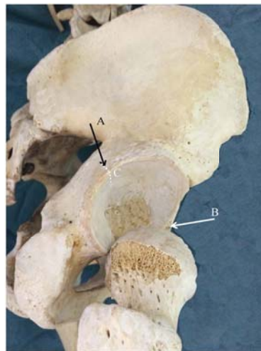
Figure 1. Schematic indicating how the Kirschner wires were fixed into the acetabular bone on a lateral image of a pelvic specimen. The line A represented the Kirschner wire fixed into the retrolateral wall of the acetabulum, the line B was fixed into the anterolateral wall, and the dash line C represented split line of retrolateral wall in the acetabulum

Three days after admission, the patient underwent pTHA. The patient was positioned and stabilized on the operating table in the lateral decubitus position. A posterolateral approach to the hip was performed. The operating table and the bony anatomy landmarks were used as reference in the prostheses implantation. Two 2.5-mm Kirschner wires were fixed into the acetabular bone to help expose the acetabulum. One of the two Kirschner wires was too close to the retrolateral wall of the acetabulum (see Figure 1), causing a split line. A Trilogy AB™ (Alternate Bearing) Acetabular System (Zimmer, Inc., USA), which includes cementless alumina/alumina ceramic bearing couples with femoral stem size (12#) coated with hydroxyapatite on the proximal third, an alumina ceramic head with a 28-mm diameter, and an alumina ceramic insert (liner) with a metal acetabular hemispherical porous cup (46 mm), was inserted. The intended cup position was at 40° inclination and 25° anteversion. A 2-mm press-fit was used for the cementless socket fixation. When the cup was impacted to the bone bed, it moved with the whole pelvis when the stem was shaken, which showed that the cup was stable. The size and neck length of the prostheses were selected according to the correct limb-length that corresponded with gluteal muscle tension. The external rotators were reattached to the greater trochanter using non-absorbable sutures.