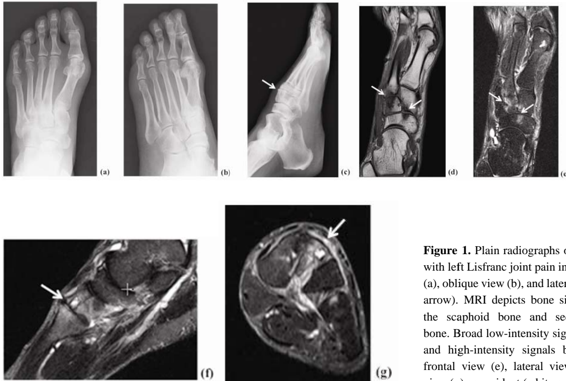
Figure 1. Plain radiographs of an OA patient with left Lisfranc joint pain in the frontal view (a), oblique view (b), and lateral view (c, white arrow). MRI depicts bone signal changes in the scaphoid bone and second metatarsal bone. Broad low-intensity signals by T1W (d) and high-intensity signals by STIR in the frontal view (e), lateral view (f), and axial view (g) are evident (white arrows).

Left forefoot pain had manifested suddenly 5 months before presentation. Tenderness was noted along the left first metatarsal bone. Plain radiographs showed mild OA of KL grade II (data not shown). MRI revealed bone signal changes in the first Lisfranc joint. One month later, the pain had disappeared (P1).