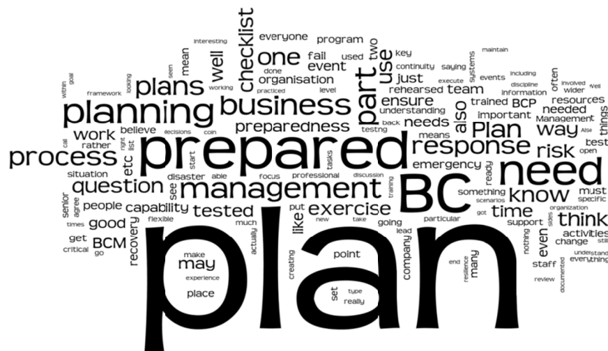
Figure 1. Frequency of words in the corpus reflected in the font size

A text corpus of 6,555 words was generated from the discussion. A word cloud graph based on the text corpus was created using the online algorithm wordle developed by J. Feinberg ( www.wordle.net ). The graph displays words with font size correlated with their frequency in the text corpus. Figure 1 shows the result.