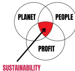
Figure 1. The triple bottom line

It is important to note that the overarching concept of sustainability, as defined by the United Nations and encapsulated in the 17 Sustainable Development Goals (SDGs). These goals can be summarized as striving to meet the needs of the present without compromising the needs of future generations. When a company incorporates some of these SDGs into its strategy, it is referred to as practicing sustainability. When sustainability is ingrained in a company's strategy, it is commonly referred to as Corporate Social Responsibility or Corporate Sustainability, a framework that encourages businesses to consider the "triple bottom line" – "people, planet, and profit."