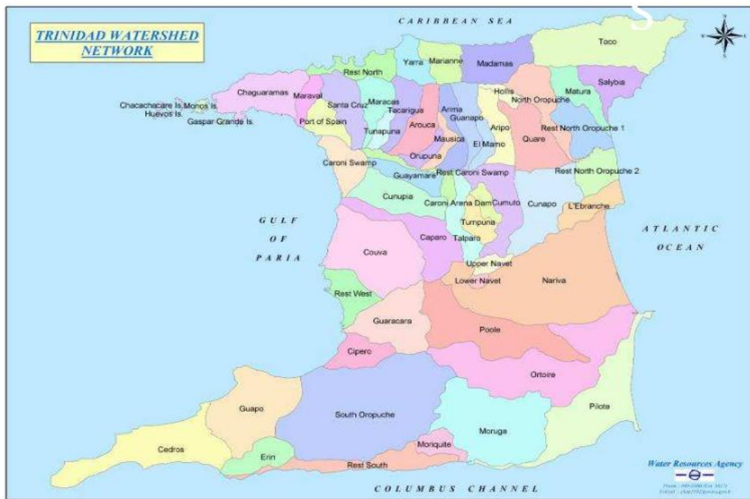
Figure 2. Trinidad watershed network

Although there seems to be no change in average rainfall in the country, flooding is a recurring problem in Trinidad and Tobago. In both islands, it causes substantial crop destruction, damage to property and household appliances, health problems, and severe inconvenience to whole communities on an annual basis. Perennial flash floods tend to occur along the foothills of the Northern Range, the Caparo River Basin, and the South Oropouche River Basins. In fact, flooding tends to occur along the floodplains of the Caroni, Caparo, North Oropouche and South Oropouche River Basins. Figure 2 provides an illustration of the watershed network in Trinidad.