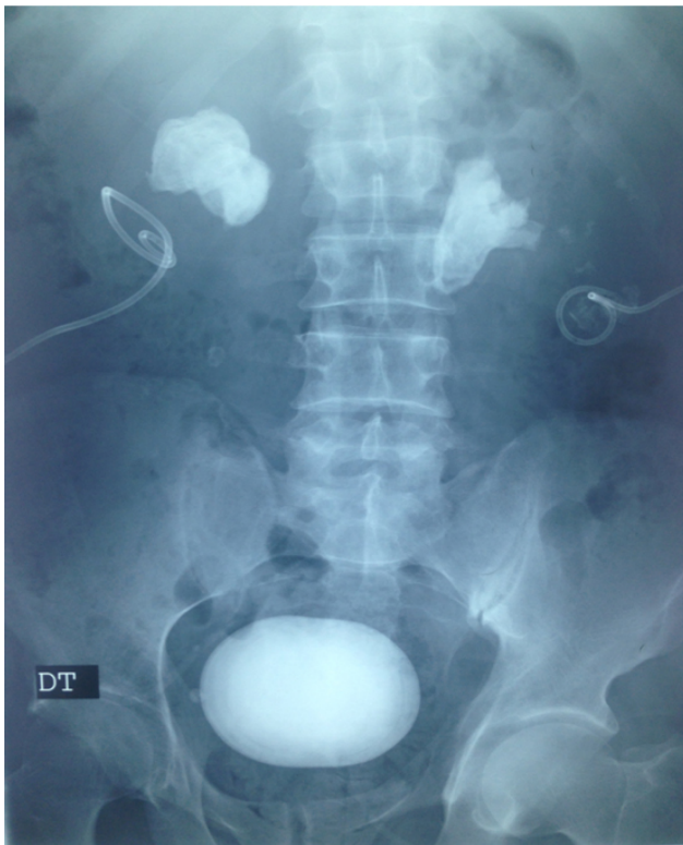
Figure 1. The plain kidneys, ureters, and bladder X-ray revealing three giant urinary stones with in-place bilateral nephrostomy tubes

3) and showed the huge bilateral renal stones measuring approximately 5 cm × 4.5 cm × 2.6 cm each and completely filling renal pelvis, together with a giant bladder stone of a nearly 8 cm × 6 cm × 5.8 cm almost occupying the intravesical cavity. The patient was urgently given intravenous (IV) hydration with saline serum, and antibiotics. Initially, we intended to treat the patient conservatively with indwelling ureteral stents but the presence of a huge bladder stone filling completely the intravesical cavity made it impossible for the operator to identify ureteral orifices. Therefore, we carried out US-guided bilateral percutaneous nephrostomy which were very effective in draining frank pus from renal cavities.