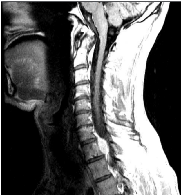
Figure 1. Sagittal view of cervical spine MRI demonstrating a paraspinal tumor at the level of the T1 vertebral body

Workup was initiated with plasma and urine metanephrine studies. The plasma normetanephrine levels was 1.9 nmol/L (normal range: < 0.20) while the 24 hour urine total metanephrines level was 1349 mcg/24 hrs (normal range: 200-614) These elevated tests in the face of an abdominal mass raised concern for pheochromocytoma. An I-123 metaiodobenzylguanidine (MIBG) scan was performed and showed intense radiotracer uptake by the abdominal mass and a focus of radiotracer uptake was seen in the posterior right lobe of the liver as seen in Figure 3. Additional abnormal foci of increased uptake were seen throughout the musculoskeletal system, including posterior to the right transverse process of T3, within the right T8 vertebral body, right ilium, left ilium, sacrum, right gluteus muscles, and right superior pubic ramus. There were additional foci within the spinal canal, most intense at the L4 level. Other foci in the spinal canal were seen at the T1 level, and right S1-2 neural foramen. A focus within the anterior myocardium, or pericardium, was in the area of the right ventricular outflow track. These areas of MIBG-avidity were all thought to be consistent with metastatic disease.