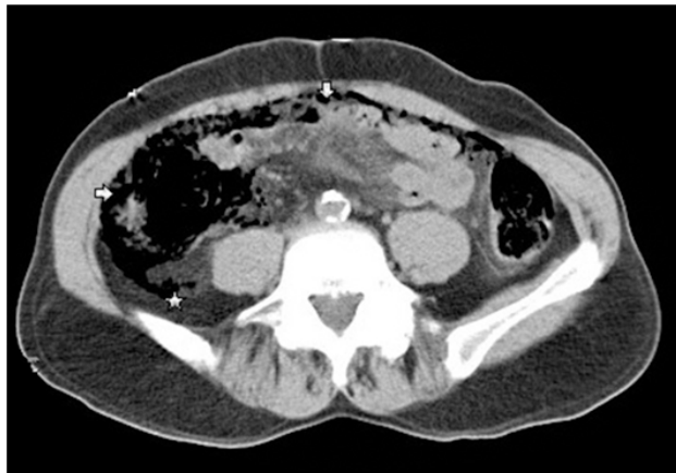
Figure 1. A computed tomography scan reveals pneumatosis coli (white arrows) and retroperitoneal free air (white star)

Patient was initially managed with fluid resuscitation and antibiotic administration, but then required emergent intubation, central venous access, and vasopressor support before being taken for exploratory laparotomy. Upon operative exploration, the entire small bowel from 10 centimeters distal of the ligament of Treitz to the terminal ileum was devitalized (see Figure 2). Also there was diffuse vessel thrombosis to the gastrocolic ligament and omentum (see Figure 3). Pneumatosis was appreciated in the ascending, transverse, and proximal descending colon. The sigmoid colon and proximal rectum were also found to be devitalized. The bowel necrosis was noted to progress during the exploration of the abdomen. Intraoperative intravenous fluorescein administration and inspection with a woods lamp was utilized to confirm no arterial flow to the distal small bowel or the entirety of the colon. There was no anatomical evidence of volvulus, intussusception, hernia, obstruction, or adhesions to explain the profuse distribution of bowel infarction. Due to the extensive bowel necrosis burden and unlikelihood of survival following complete resection of small bowel and colon, the family of the patient requested no further operative or resuscitative interventions. Shortly after discontinuing vasopressor support, the patient expired. Blood cultures were positive for Clostridium septicum .