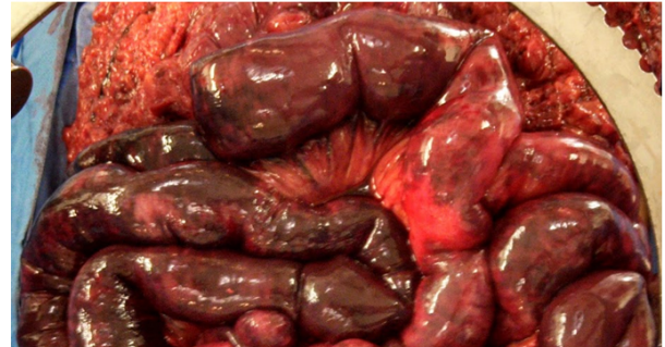
Figure 2. Ischemic small bowel

These episodes of hemodynamic excitation are the presumed primary mechanism responsible for acute cerebrovascular accidents, myocardial infarctions, and ischemic organ complications. [2]