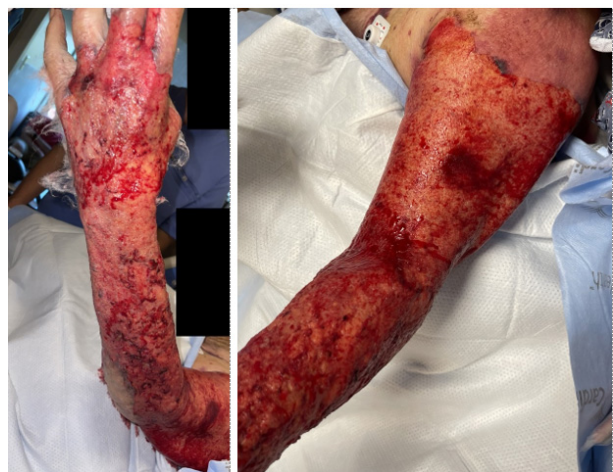
Figure 7. Post Operative Day 1 from extensive debridement on hospital day 9