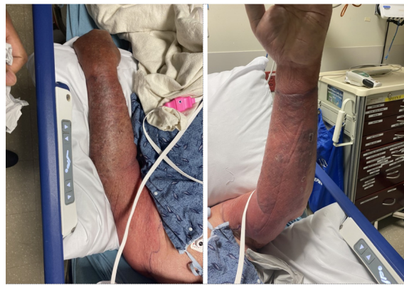
Figure 1. Presenting physical exam findings on hospital day 1

negative for any soft tissue emphysema or fluid collection. Based on clinical evaluation (lack of tenderness outside the area of erythema, no pain with passive range of motion of the elbow or wrist), imaging, and labs, there was low suspicion for necrotizing fasciitis. The patient was started on IV antibiotics for suspected cellulitis and was admitted for observation. Infectious disease (I.D.) was additionally consulted. Per their evaluation, they did not suspect any other locus of infection after a thorough physical exam including ocular exam and palpation over the site of the patient's pacemaker. Dermatology additionally evaluated the patient, noting an absence of ocular lesions. I.D. had a concern for necrotizing fasciitis that was not shared by the surgical team, therefore surgery was not performed on the first day of admission.