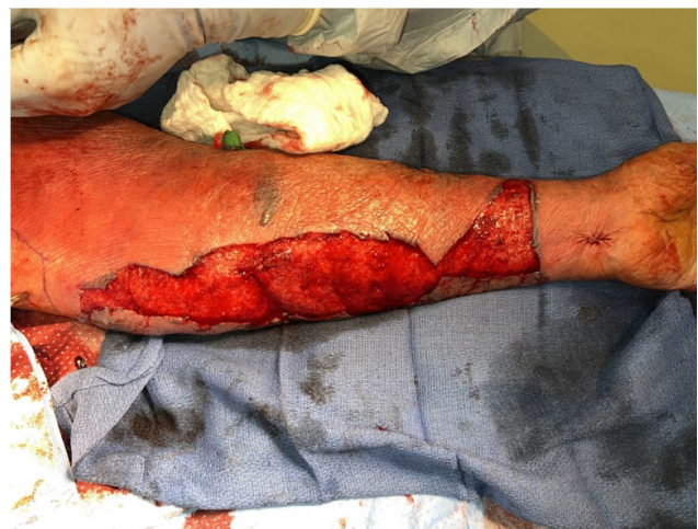
Figure 4. Intraoperative findings on hospital day 2

signs of necrotizing fasciitis in any of the explored fascial planes of the extremity. There was a notable absence of dishwasher fluid and the bullae were found to contain only blood. No purulent collections were identified. Several areas of devitalized skin were debrided (see Figure 4). Multiple cultures were taken as well as stat frozen skin and fascial pathology samples which did not show areas of necrosis.