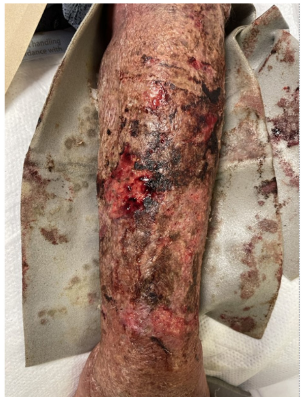
Figure 6. Physical Exam findings on hospital day 8

failure and persistently elevated lactate (see Table 1). Despite the exclusive localization of his infection to the upper extremity, his prognosis was guarded. Understanding that systemic antifungals can require 7 days of therapy prior to achieving therapeutic concentrations, the decision was made to transition to palliative care on hospital day 14, which was 6 days after confirmation of his fungal infection. He expired one day after the withdrawal of care.