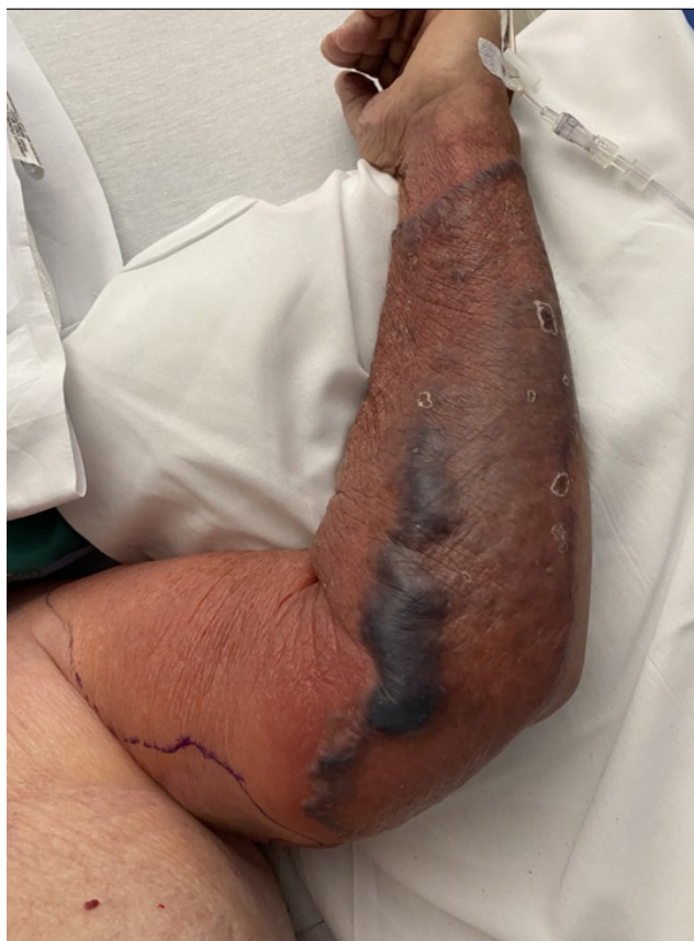
Figure 3. Physical exam findings on hospital day 2

On hospital day 2, the erythema progressed and the patient began forming hemorrhagic bullae to the medial aspect of the elbow despite administration of broad spectrum antibiotics (see Figure 3). The patient was taken for emergent debridement and evaluation of deep soft tissues of the extremity with the Orthopaedic Hand Surgery team after discussion with the Infectious Disease team. Intraoperatively, there were no