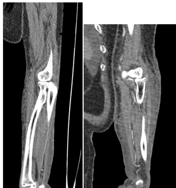
Figure 2. Computed tomography imaging of the left forearm collected on presentation, demonstrating inflammatory changes of the skin and subcutaneous tissues without soft tissue gas or evidence of deep infection