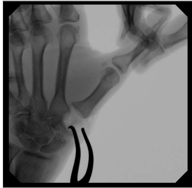
Figure 2. Intraoperative radiograph with axial traction applied to the thumb demonstrating complete trapeziectomy and lack of osteophytes between thumb and index metacarpals

remainder of the tendon was placed into the dead space between the first metacarpal and scaphoid. A satisfactory result was confirmed fluoroscopically as seen in Figure 2. Due to preoperative hyperextension, the MCP joint was pinned in approximately 20 degrees of flexion. The patient was placed into a thumb spica splint with the thumb in abduction.