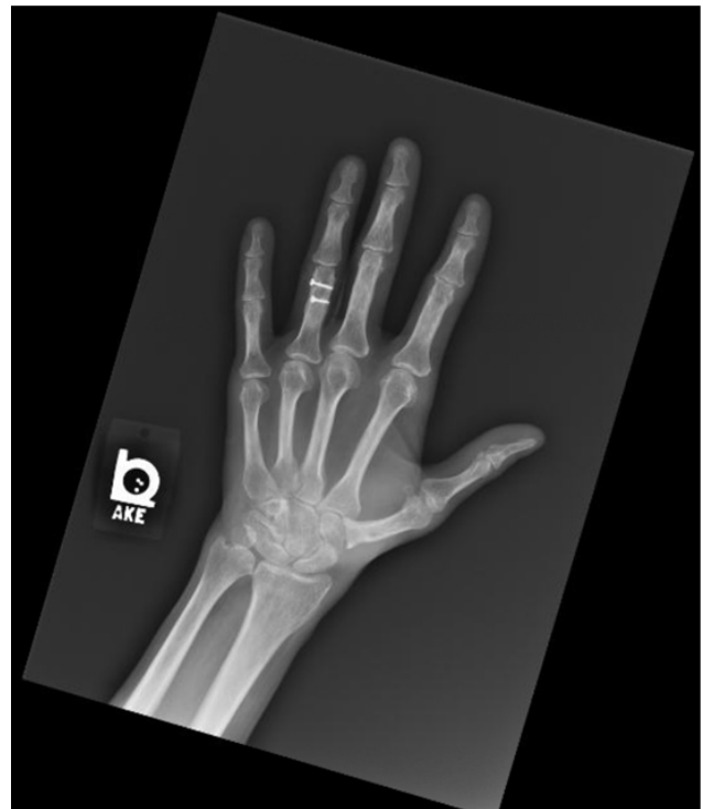
Figure 4. Final radiograph taken after pin removal demonstrating maintenance of thumb metacarpal suspension without subsidence and without dislocation

At four months, she was seen for her final scheduled post-operative visit, at which time she reported no limitations with activities or work due to pain. On physical exam, she had a normal appearance to her left hand with no tenderness over the CMC joint space. She demonstrated satisfactory circumduction, and was able to approximate her thumb tip to her other fingertips as well as the base of the small finger. Final X-rays showed maintenance of suspension of her thumb metacarpal without subsidence and without dislocation (see Figure 4).