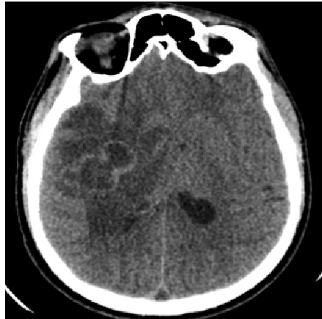
Figure 1. Non-injected axial CT scan showing the multicystic appearance

Initially the patient underwent abscess puncture and drainage under Neuronavigation guidance. Aspiration using a Sedan biopsy needle was unfortunately unsuccessful as the content was very viscous. Therefore, we were not able to evacuate the collection enough. We withdrew a scant amount of the abscess that enabled identification of the Nocardia by DNA sequencing method. It was susceptible to Imipenem/Cilastatin (Tienam), Amikacin and Trimethoprim/Sulfamethoxazole (Bactrim), Ceftriaxone and Minocycline.