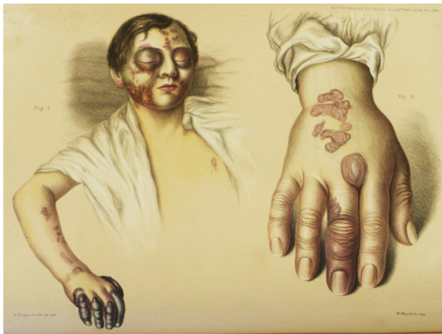
Figure 1. Original depiction of cutaneous form of sarcoidosis in “ Illustrations from Clinical Surgery ” by Jonathan Hutchinson [3]

epigastric abdominal tenderness. Initial laboratory values showed an elevated alkaline phosphatase of 249 U/L (normal 37-125 U/L), and a normal total bilirubin and transaminases. Abdominal ultrasound showed gallbladder wall thickening, intra and extrahepatic bile duct enlargement, with a common bile duct (CBD) measuring 1.5 cm. A computed tomography (CT) abdomen confirmed intra and extrahepatic ductal dilation but was otherwise unremarkable. CA 19-9 was drawn and elevated at 148.8 U/ml (0-37 U/ml normal). Serum angiotensin converting enzyme (SACE) was normal at 47 (8-52 normal). A CT of the chest was normal.