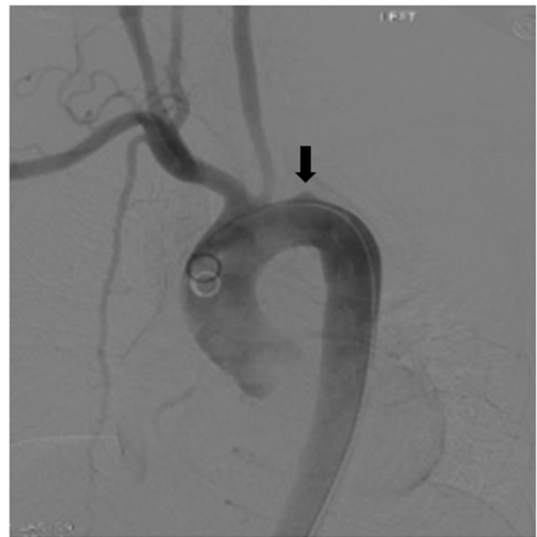
Figure 2. Catheter aortogram showing occlusion at the origin of the left subclavian artery

A magnetic resonance angiogram (MRA) demonstrated occlusion of the left subclavian artery from its origin to the vertebral artery where it was reconstituted via the left vertebral artery and left carotid artery branches, consistent with subclavian steal (see Figure 1). Findings were confirmed with catheter angiogram and aortogram (see Figure 2). High-grade stenosis of the vertebral artery at its origin and moderately severe narrowing and tapering of the left vertebral artery were also noted. There was no evidence of aortic involvement. These findings along with her clinical presentations were consistent with a diagnosis of Takayasu's arteritis (5/6 criteria by the American College Rheumatology guidelines).