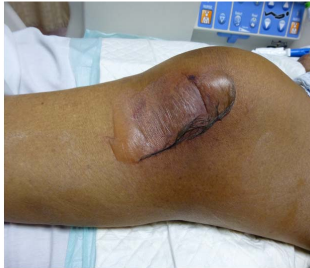
Figure 1. Tense bullae on a pressure site

Serial tissue sections of skin demonstrate the development of an intraepidermal acrosyringeal bulla, accompanied by superficial, non-inflammatory purpura and stromal edema (see Figure 2). One sees modest stromal RBC extravasation, mild capillary ectasia, mild stromal edema and hemosiderin deposition in the subcutaneous fat. The adjacent epidermis appears intact, without spongiosis, inflammation or ischemic changes.