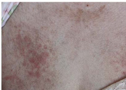
Figure 1. Persistent pruritic lichenoid plaques with somewhat linear appearance on anterior chest.

In the clinical course, pruritic lichenoid plaques had become apparent (see Figure 1). Skin biopsy of this plaques revealed dyskeratotic keratinocytes within the cornified layer and the superficial epidermis (see Figure 2). There were diffuse infiltrates of numerous neutrophils and lymphocytes in the dermis. Therefore, we considered these lichenoid plaques to be atypical skin lesions of AOSD, and continued the same dose of steroid therapy. Her febrile attack, arthralgia, liver damage, dermatological findings, and hyperferritinemia were gradually improved (see Figure 3). After eight weeks, her liver function was normalized, other laboratory data and skin lesions were improved and she is keeping well at outpatient for almost two years without prednisolone.