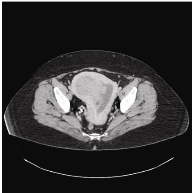
Figure 1. CT Abdomen/Pelvis with IV and Oral Contrast. Uterine mass measuring 8.3 cm × 6.9 cm × 5.6 cm consistent with endometrial neoplasm.

Computed tomography abdomen and pelvis was significant for an endometrial mass approximately 8.3 cm × 6.9 cm × 5.6 cm with distention of the endometrial canal (that) probably invades more than half of the myometrial thickness. No definite extension outside the uterus and no adnexal mass was identified (see Figure 1). A diagnostic hysteroscopy, dilatation and curettage was scheduled.