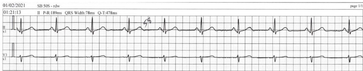
Figure 4. Recovery of HR (HR 78)

Cardiac telemetry monitor at home for seven days showed sinus rhythm with an average HR of 76 (HR ranging from 58-123). His recovered HR was 78 (see Figure 4). There were rare premature ventricular contractions (PVCs) and premature atrial contractions (PACs). Nuclear stress test revealed no evidence of ischemia.