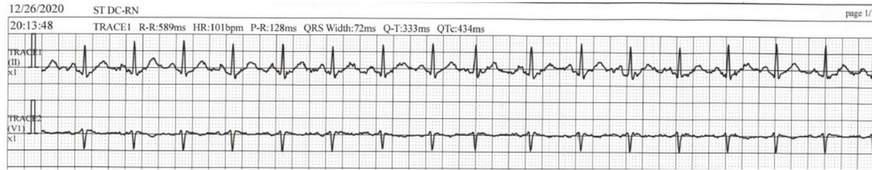
Figure 1. Sinus tachycardia on 12/26/2020 Day 1 on second admission (HR 101)

gram (EKG) and elevated Troponin at 0.37. Echocardiogram 01/02/2021 was overall unremarkable with left ventricular ejection fraction (LVEF) 60%-65%, grade 1 diastolic dysfunction, and right ventricular systolic pressure (RVSP) of 26 mmHg.