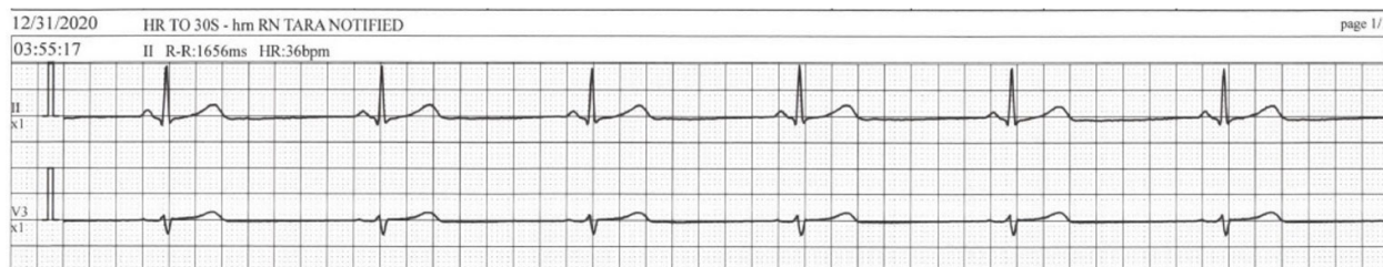
Figure 3. Sinus bradycardia on 12/31/2020 during sepsis (HR 36)