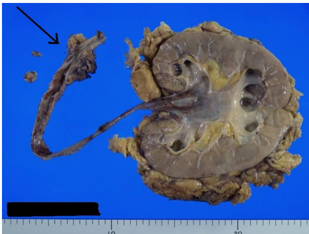
Figure 1. The resected right kidney and ureter. The ureter has 3 cm × 3 cm × 2 cm tumor (arrow). The kidney shows hydronephrosis.

Therefore, right uretero-nephrectomy was performed. There was a right ureter tumor at the distal part and hydronephrosis (see Figure 1). The tumor of right ureter measured 3 cm × 3 cm × 2 cm. Microscopically, the mucosa, submucosa, muscle layer and adventitia were occupied by a medullary undifferentiated carcinoma cells (see Figure 2A). No apparent differentiations were seen. Because the ureteric tumor did not show significantly specific features and the most common histological type of ureteric tumors is urothelial carcinoma (UC), the author diagnosed the ureter tumor as high-grade non-papillary urothelial carcinoma. No Immunohistochemical study was done at that time; but later retrospective immunohistochemical study showed the same findings as those of the bladder tumor.