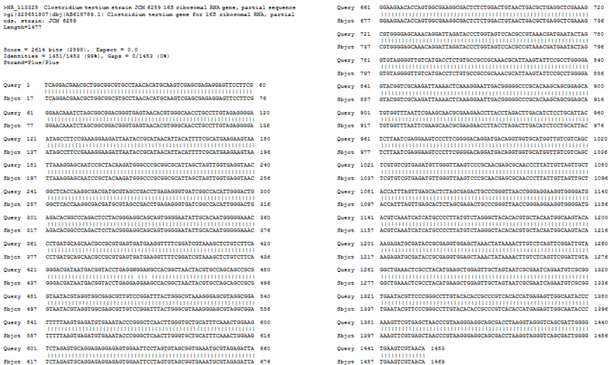
Figure 2. Compared with C. tertium strain JCM 6289 16S ribosomal RNA gene. The sequence had 99% similarity.