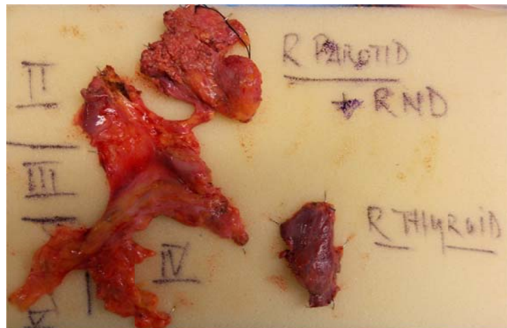
Figure 2. Post-surgical excision of the right parotid gland and right thyroid lobe

The patient was discussed in the head and neck and thyroid multidisciplinary team meeting. A revision, total conservative right parotidectomy with a right selective neck dissection with a right thyroid lobectomy was recommended. The procedure was done via an extended cervico-facial incision. The facial, vagus, accessory, hypoglossal and recurrent