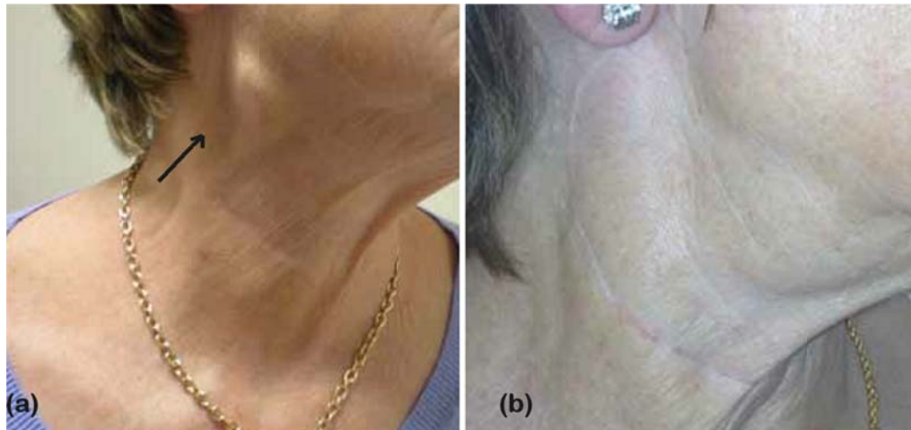
Figure 1. View of the right lateral neck (a) Pre-operatively and (b) Post-operatively (at 18 months follow-up)

The patient was subsequently referred to the senior author for further management. On examination she was found to have a 3 cm × 3 cm smooth, but firm, mass in the right tail of the parotid gland with no palpable lymphadenopathy (see Figure 1a). Ultrasound scan (US) revealed a hypoechoic 1.7 cm × 1.2 cm × 2 cm lesions in the right parotid, along with a smaller 7 mm × 4 mm × 5 mm satellite lesion adjacent to the primary lesion. The scan of the neck also identified a 1.5 cm × 0.9 cm × 1.2 cm hypoechoic lesions with an irregular, almost scalloped outline in the right lobe of the thyroid. An ultrasound guided fine needle aspiration (USS-FNA) of the parotid thyroid lesions was performed. Cytological analysis, demonstrated abundant myxofibrillary matrix admixed with singly scattered and small clusters of bland plasmacytoid cells in the parotid lesions and the thyroid consistent with benign PSA of the right parotid gland with metastases to the right thyroid.