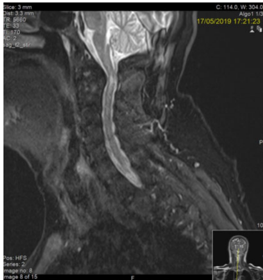
Figure 4. MRI sagittal with ischaemic changes in the cervical spinal cord

appearance of C2 and narrowing of the cervical spine at this level. There was a focal area of central intramedullary hyper signal intensity. Multilevel flavum, ligament and facet hypertrophy from C3 to C7 with significant canal stenosis and chronic degenerative changes were also noted. There was no significant foraminal narrowing causing nerve root compression. A CT guided bone biopsy confirmed a significant amount of fibrous tissue, but no giant cells. Endocrinology opinion was sought to address the deranged thyroid and kidney function (see Figures 4-5).