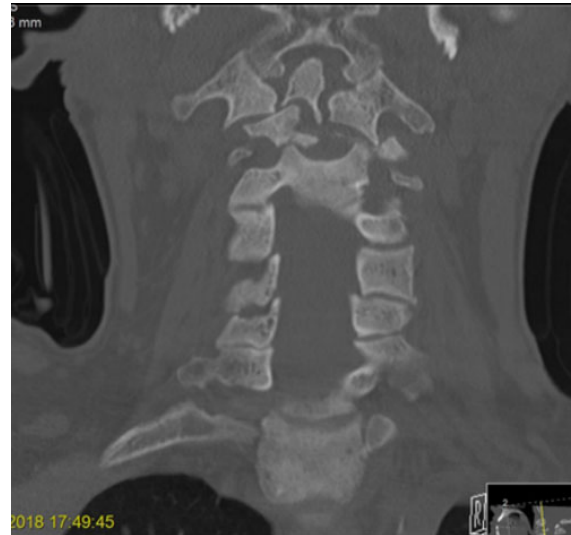
Figure 2. Lesion seen on coronal CT cervical spine

Multi-nodular goitre was an incidental finding and an ultrasound (USS) of his thyroid was performed, which showed