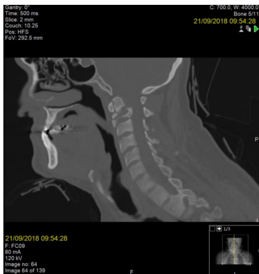
Figure 5. Sagittal CT taken 6 months later

The most probable diagnosis was Brown tumour of the C2 and this was related to persistent secondary hyperparathyroidism and associated ESRD.