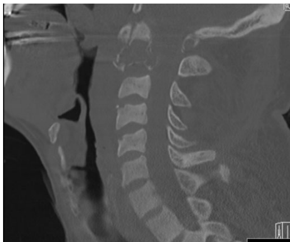
Figure 1. Lesion seen on sagittal CT cervical spine

normal appearances of the thyroid with no evidence of parathyroid adenoma. Further nuclear medicine Parathyroid SPECT scan showed no evidence of malignancy. Other investigations included tumour markers, protein electrophoresis, were performed in order to confirm the absence of metastatic disease and bone marrow infiltration. Whilst there is a well understood relationship between renal impairment and primary and secondary hyperparathyroidism, it is necessary to rule out adenoma, hyperplasia and carcinoma in patients who develop primary hyperparathyroidism.