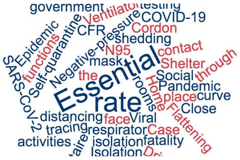
Figure 2. Word cloud of events experienced by Tunisian managers during the COVID-19 period